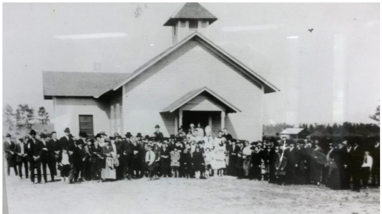
Consecration of the first St. John the Baptist Catholic church in Grand Bay on November 16, 1924