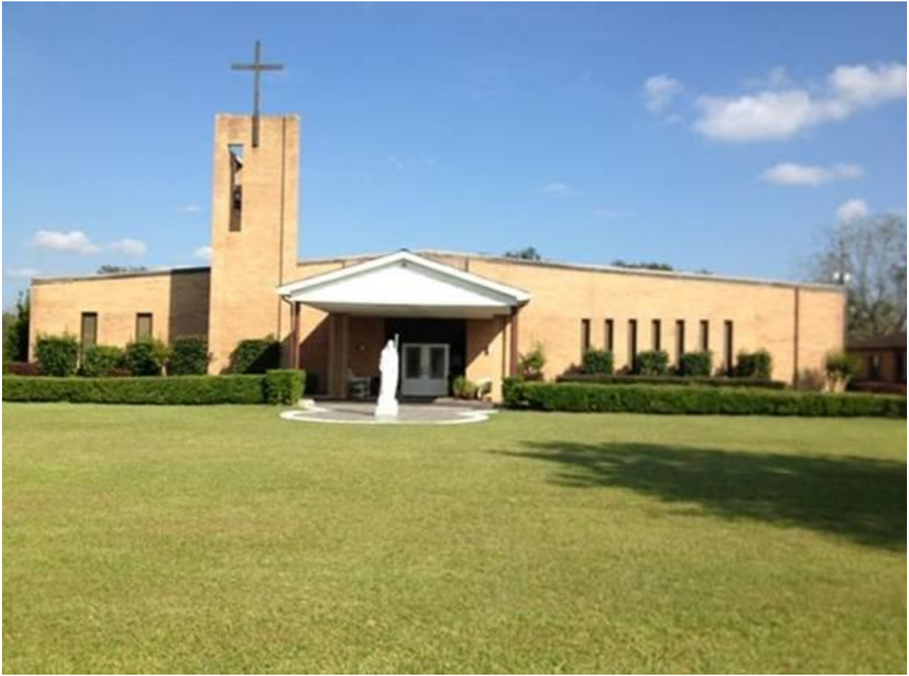
The New Church blessed and consecrated by Bishop May on June 18, 1972